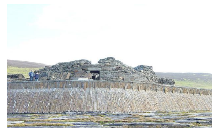
Mid-Howe Broch, Rousay